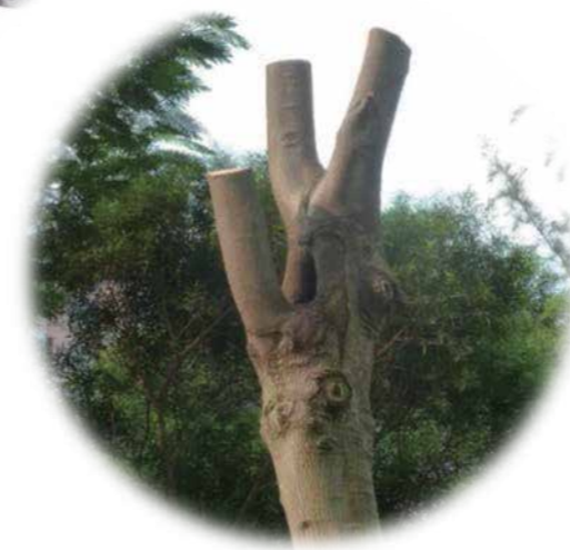
Topping / improper pruning 截頂 / 不適當修剪