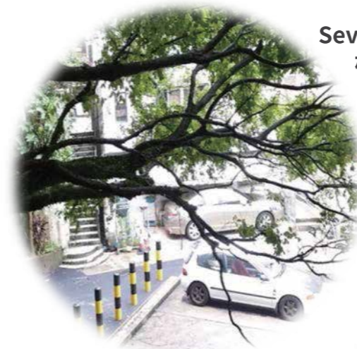
Dieback twigs 樹枝枯死