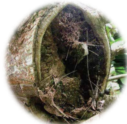
Wood decay / cavity 腐壞 / 樹洞