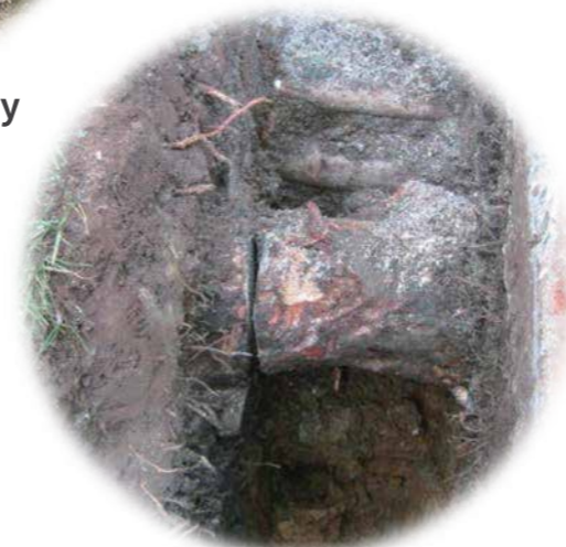
Severely cut / damaged root 根部被嚴重切割或損害