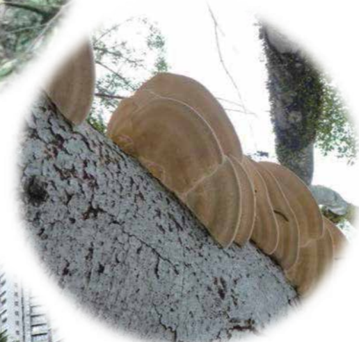
Fungal fruiting bodies 真菌子實體