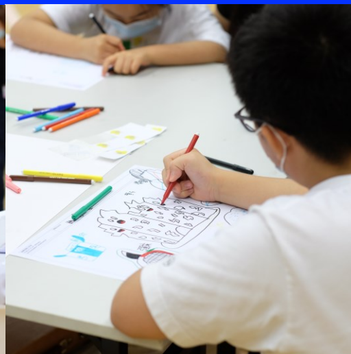
部分二：一齊「砌」- 主題探索 Part II : Model Making – Thematic Exploration