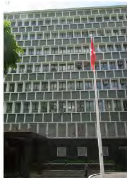
現時中區政府合署中座的外牆 EXISTING CGO MAIN WING FACADE